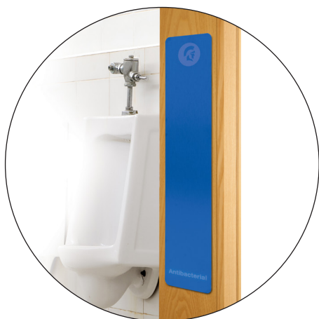
Stericore Finger Plate

Patent Protected. All test results and kill times available on request.