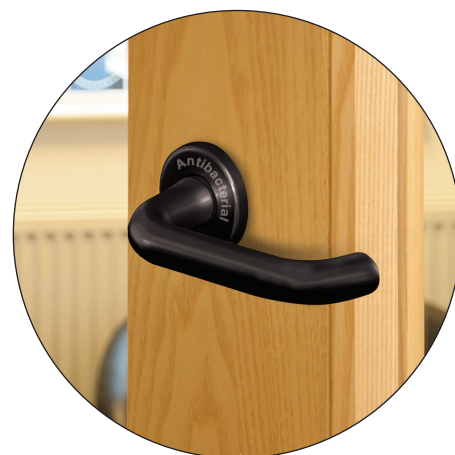
Stericore Lever Handle

60 minute fire rated - supplied in pairs